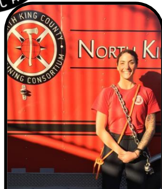
Week 3 Recruit Avcu